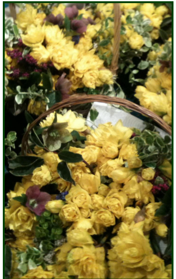
Posies for Mothering Sunday

In later times Mothering Sunday became a day when domestic servants were given the day off to visit their mother church usually with their mothers and other family members. This became a special day, as, before holidays became recognised, it was often the only time the whole family was able to get together. Children would pick flowers along the way to place in church or to give as gifts to their Mothers.